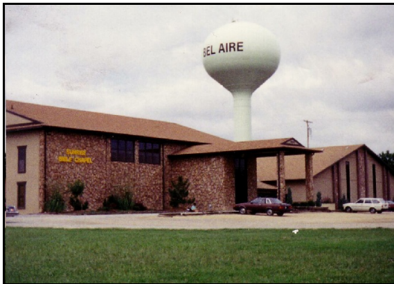
Figure 1 - Sunrise Christian Academy, Wichita, KS

After I left Emporia State University, I had difficulties with student teaching and failed to get a teaching certificate. This is a long story in itself but for a time I gave up on being a teacher. I lived in Wichita for some years and then became a teacher in a Christian School in Wichita, Kansas, known as Sunrise Christian Academy. I taught a variety of science and math classes from sixth grade through high school over a period of four years. It was also during the years I was a teacher in Wichita that I was also very active in the ministry of the Bible-Science Association.