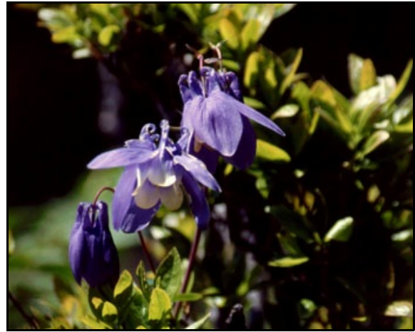
Figure 5 Picture of a flower taken on the shore of Lake Baikal, in Eastern Siberia, Russia, June 1995.

When people change their point of view from evolution to young-age creation, it is usually the scientific evidence that convinces them, not the Biblical evidence. The scientific evidence for creation can make a powerful impression when it is understood. It shows people that what the Bible says about creation is objectively true, not just subjectively true. There is a misconception some have about the Bible that it is only true in the sense that it has a personal subjective meaning to the believer but it doesn't really tell us the truth about the world historically or scientifically. Thus, Christians need to be taught about creation well so that they can understand that the Bible is really true to the real world and that truth is not a matter of what we feel. Seeing the Bible as objectively true historically and scientifically supports a strong view of the inerrancy of the Bible. Thus I think creation acts like an anchor to help a Christian hold onto their faith with more confidence amid life's challenges.